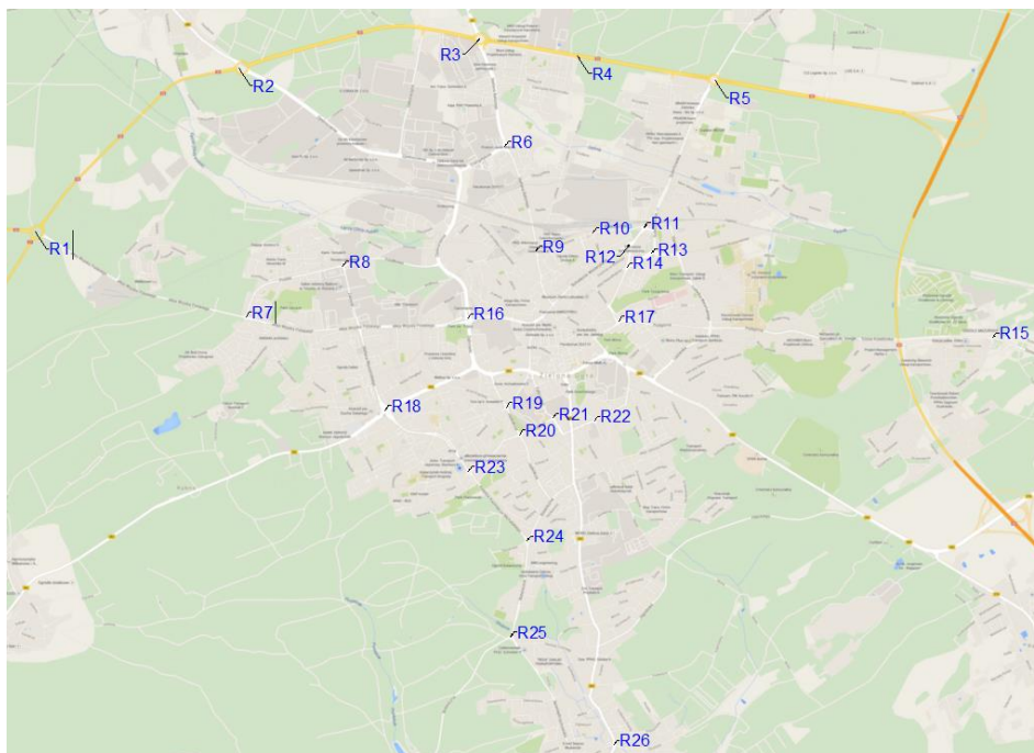
Fig. 1. Location of roundabouts in Zielona Góra [22]

Parameters and characteristics of roundabouts in Zielona Góra are summarized in tab. 3.