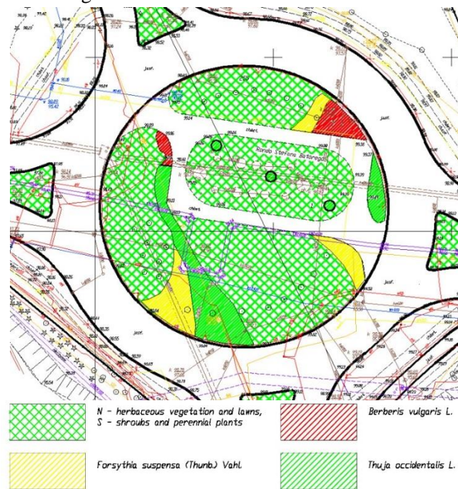
Fig. 3. Run of the hard infrastructure through the central island of Stefan Batory roundabout including plants

roses are planted. The outer ring of the island is covered by the creeping juniper ( Juniperus horizontalis Moench.). View of the roundabout is shown in Fig. 4. Across the roundabout No. 7 runs: sewage, water pipes and energy cables. Due to the planned housing of central islands all networks are directly under the plants, as shown in Fig. 5.