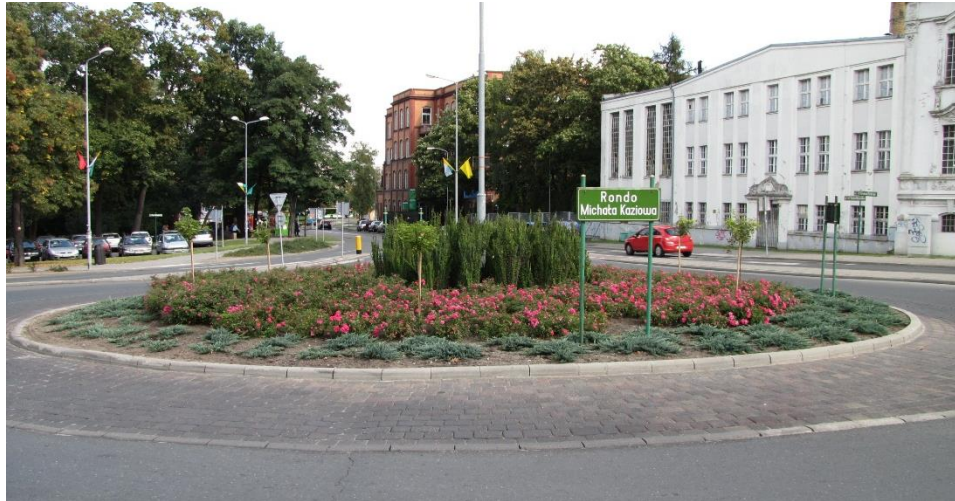
Phot. 4. View of the Michał Kaziów roundabout, a) sideview, b) plan view [22]

and low precipitation in Zielona Gora of vegetation season for the year 2010, (summarized in Tab. 4.) can lead to dry land, which in turn leads to the withering of vegetation [4, 5, 6].