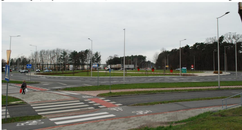
Fig. 2. View of the Stefan Batory roundabout, 2015

sorrel ( Rumex acetosella L.), yarrow ( Achillea millefolium L.), field bindweed ( Convolvulus arvensis L.) and ribwort plantain ( Plantago lanceolata L.). At the outer ring of central island places has been planted birch. In some parts mix of thuja ( Thuja occidentalis L.), forsythia ( Forsythia suspensa (Thunb.) Vahl.) and berberis ( Berberis vulgaris L.) can be found. In the middle, in 3 red flower pots grows thuja ( Thuja occidentalis L.). View of the roundabout is shown in Fig. 2.